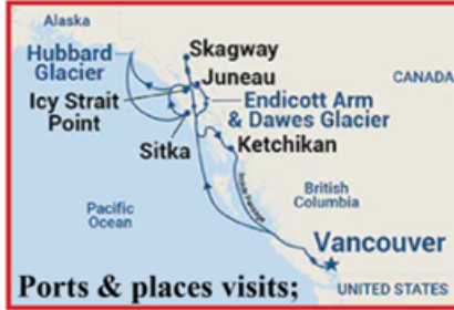
Ports & places visits;

Not included: Travel Insurance, gratuities.